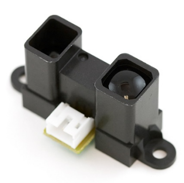
Fig. 3: IR Proximity Sensor [11].